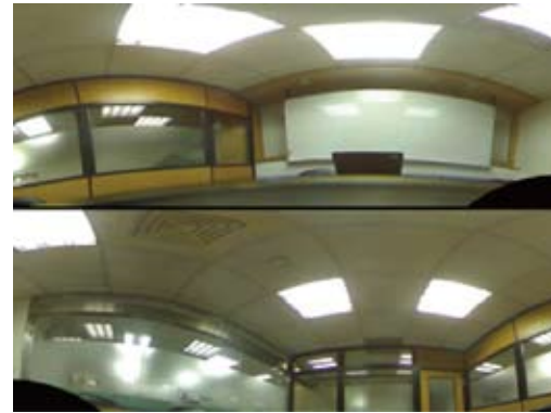
180° double table broad view