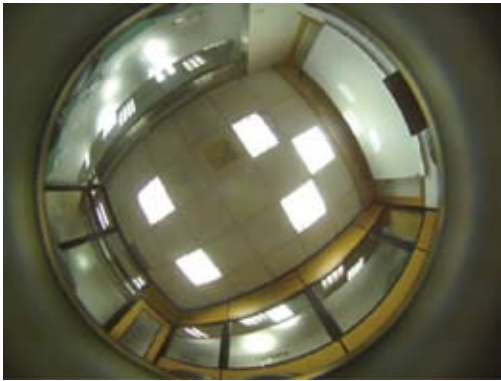
360° Table view