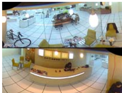
180° double broad view