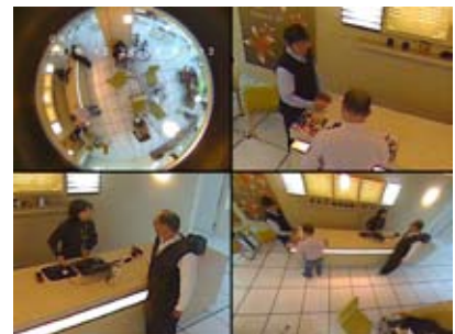
360° source view with 3 PTZ