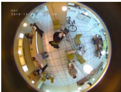
360° Source image